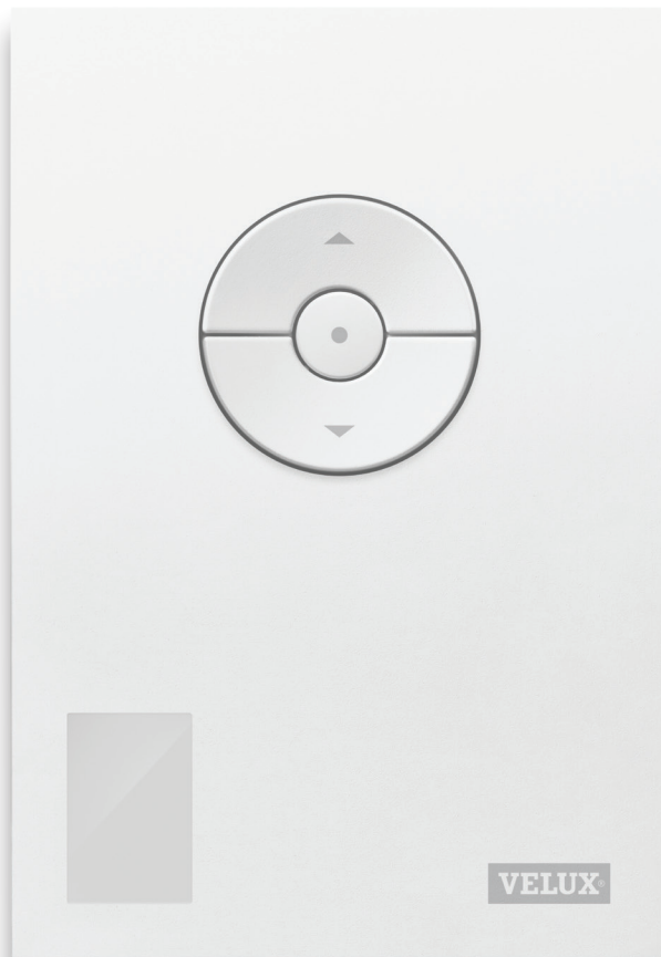
Climate Sensor Measures temperature, humidity, and CO2 levels