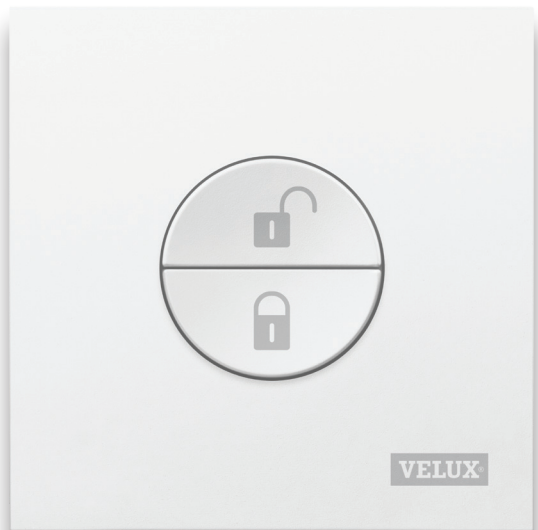
Departure Switch Activates safe mode to limit functions while you're away