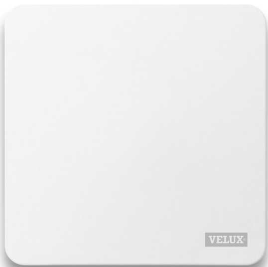
Internet Gateway Connects to Wi-Fi to monitor indoor climate and provide insights