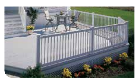
DECKING AND RAILING