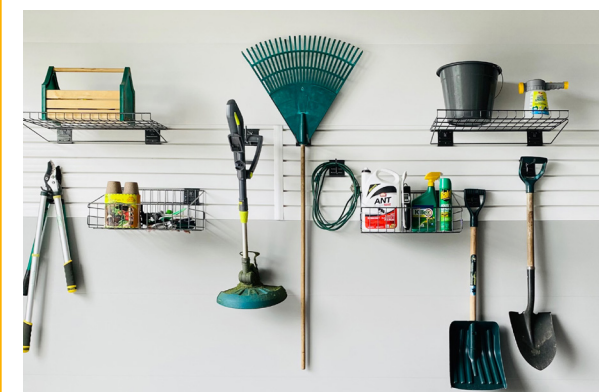
Combine Trusscore Wall&CeilingBoard seamlessly with Trusscore SlatWall.